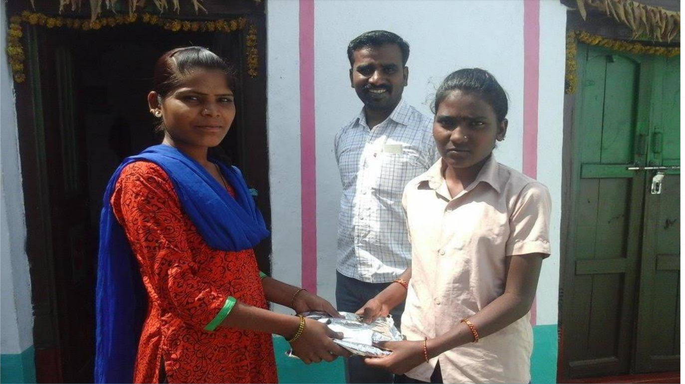
Adolescent Girls consuming Energy Dense Food at Chincholi Block

A Pregnant woman/ Lactating mother will receive 110 grams per day (427.79 kcal) of fortified Energy Dense Food (EDF) made from wheat, green gram, ragi, defatted soya, sugar and groundnut.