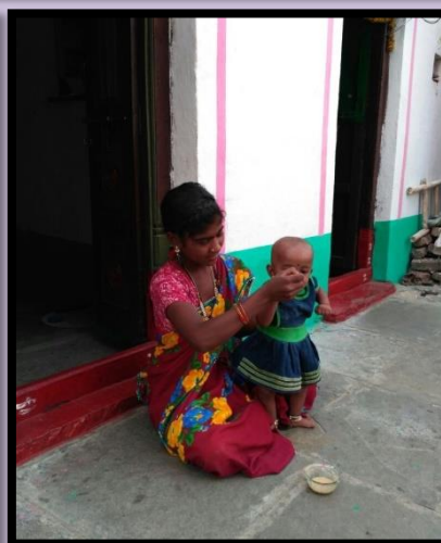
Infants consuming Energy Dense Food at Chincholi Block